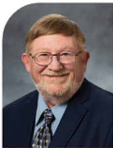
By Jeff SHELDON District 4 Director

The program basically requires a 50-gallon electric water heater or more, and a meter is installed on the outside of your home to measure the kilowatt hour (kWh) usage. The kWh rate for the program of $.0689 cents/kWh. The blended general electric rate