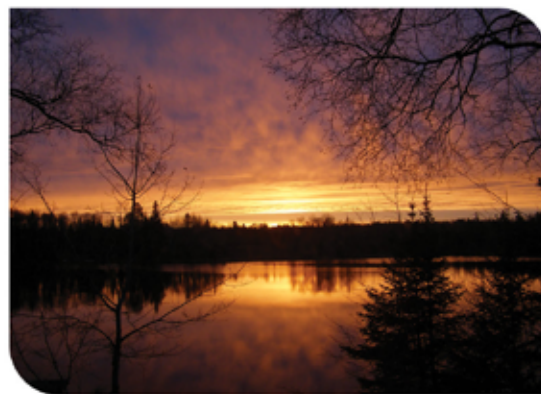
▶ Daven Ritari of Britt photographed a beautiful sunrise at the break of dawn.

Editor's Note: These board minutes have been condensed. A full copy of the board minutes can be read at www.lakecountrypower.coop under "My Cooperative." You'll need to sign up for access if you haven't already. Or call 800-421-9959 for a printed copy.